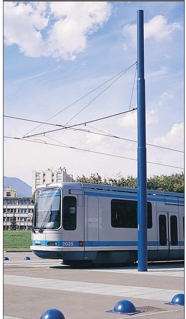
MATS SUPPORTS CATENAIRES • CATENARY POLES